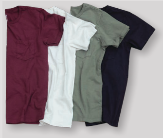
TEE2 Heavyweight pocket tee $45