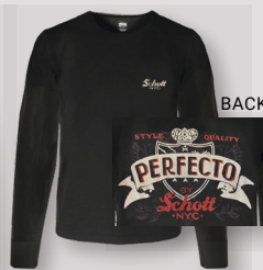
LSPER1 (Black, Off White) $70