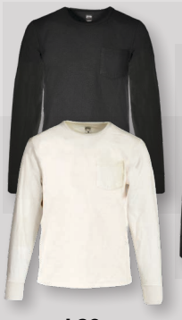
LS2 Pocket Tee $60